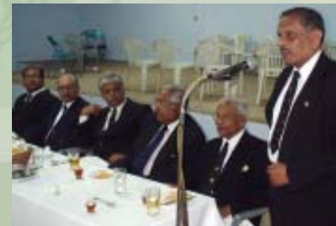
Past Masters, Day