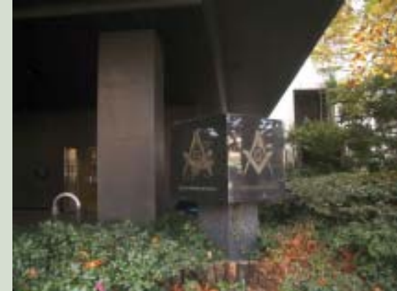
Tokyo Masonic Centre