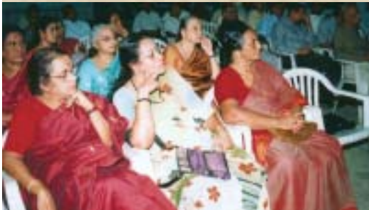
◀ An attentive audience