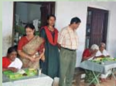
◀ W. Master's concern