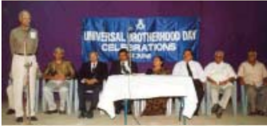
◀ Universal Brotherhood Day 2005